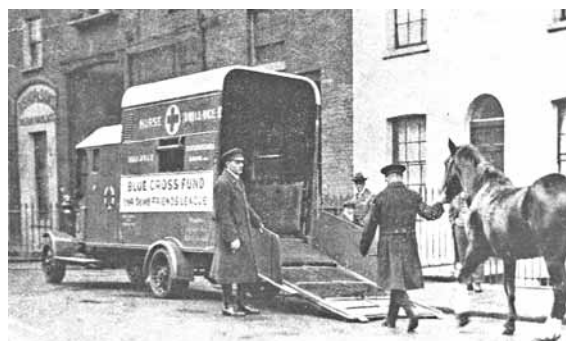
c.1923 The Blue Cross motorised horse ambulance and crew at work.

For further information, or to support The Blue Cross horse ambulance service and equine welfare work, visit our website www.bluecross.org.uk or call 01993 825517.