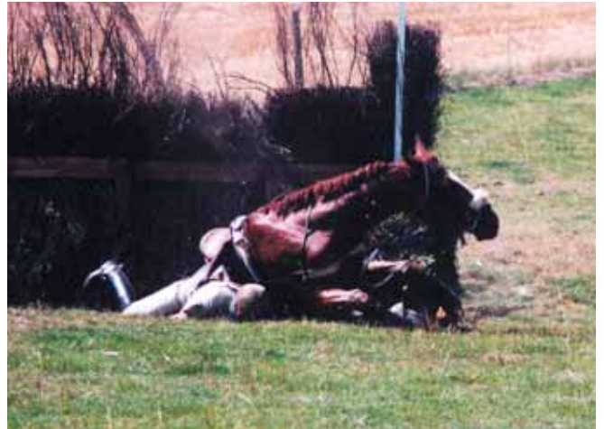
Even with the best of preparation and planning, accidents can happen.

For this reason many show organisers book The Blue Cross horse ambulance service for their event, to be assured of efficient and swift assistance to any horse requiring emergency care.