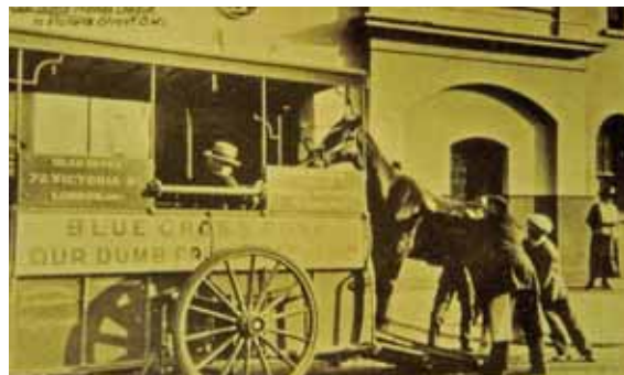
c.1906 An injured horse is helped into a Blue Cross ambulance.

Whilst the need to care for working harness horses may have diminished, The Blue Cross continues to operate a horse ambulance service catering for the modern working horse: those competing in equestrian events or injured whilst straying onto roads.