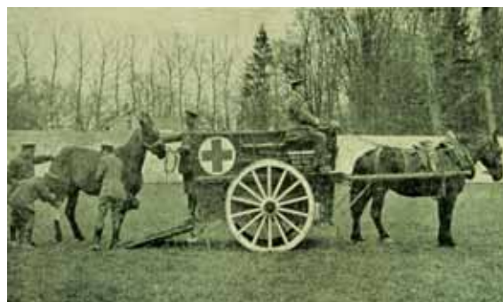
1914 A Blue Cross field ambulance rescues an injured army horse.